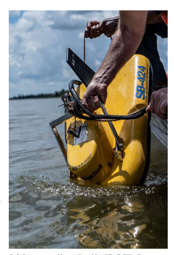
Sub-bottom profiler utilized by SEARCH.